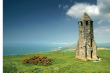
The Pepper Pot, Niton Down

Starting at Grange Chine this walk ambles over cliffs tops giving superb views of the crumbling coastline. The chines are a special coastal feature of this particular area. As you meander along the cliff top route it is easy to imagine the smuggling trade of old going on along this relatively remote stretch of coast.