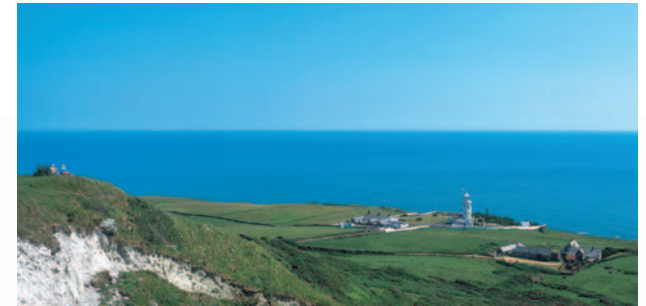
St Catherine's Lighthouse