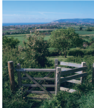
View to Sandown