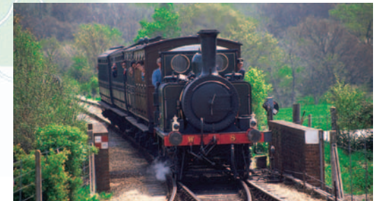
Isle of Wight Steam Railway

The walk can be continued into the centre of Ryde. Turn right over the bridge into Monkton Street. Continue down the hill 800 metres (880 yards) and turn left into East Street. Continue until you reach Dover Street, turn right and cross over the Esplanade to the seafront. Island train and bus stations along with the ferry and hovercraft terminals for the mainland are to the left along the Esplanade.