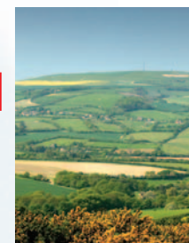
View from Stenbury Down