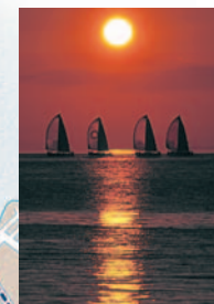
Sunset at Cowes

1 The north west section of the Coastal Path commences from the floating bridge on the Cowes side of the River Medina. Walk along Medina Road and turn right at the Police Station into Birmingham Road. Continue into the High Street and shortly after passing the Island Sailing Club turn right down Watch House Lane to Victoria Parade. Pass along the promenade to the seaward side of the Royal Yacht Squadron with its gun platform, to Egypt Point. Continue along the sea wall to Princes Esplanade, Gurnard, past the beach huts and bear left at the sailing club. Take the tarmac footpath to the right of Shore Road which rejoins above Gurnard Cliff. Follow the path into Worsley Road and take the first turning into Solent View Road, continuing into Marsh Road, past the cafe on the right. After Gurnard Luck Bridge turn left in front of Marsh Cottage to follow the signposted coastal footpath. Cross the stile and follow the cliff-top path by the chalets, continuing along the gorse lined path.